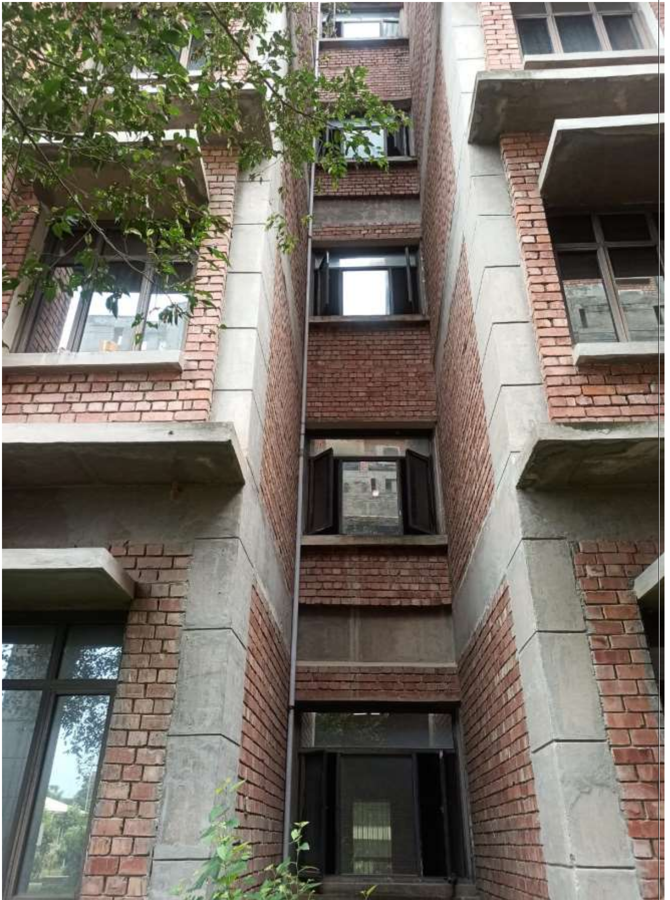
Site location, where fire escape staircase to be installed